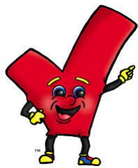
Charlie Check First from the Elementary Safety Kids Curriculum

In January, kindergarten through fifth grade students have been focusing on their personal safety skills in guidance class. All classes were reminded of Charlie Check First's #1 Safety Rule: Check First Before You Go Anywhere With Anyone! Topics covered in these safety classes included the importance of checking with the adult taking care of you, and what to do if you are ever separated from your buddy. Students also discussed observation skills and how we can be "wise with our eyes" to stay safe. Being home alone and navigating through emergency situations were a part of the conversation as well. Lastly, students went over some examples in which their Power NO should be used so they can be assertive and remain safe at all times.