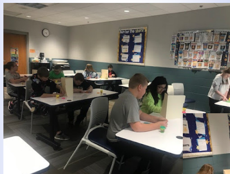
Fourth graders making their play-doh creations