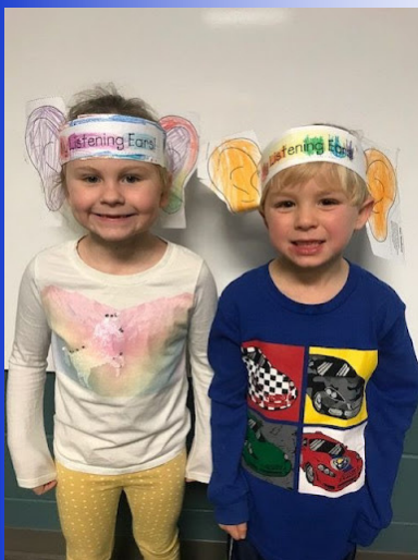
First graders wearing their listening ears

Sixth graders finished their Problem Solving Unit this month, and took time to understand the action steps of analyzing the problem, brainstorming options, considering each option, and deciding and doing the best option. On their Xello portfolio, they finished a lesson that explored how their school subjects relate to a variety of future career options. Additionally, they thought more in depth about how their chosen interests can assist them in job searching. In January, students will begin the Substance Abuse and Prevention Unit.