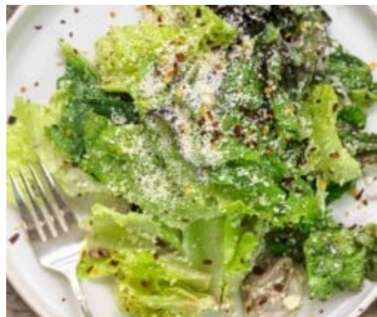
Lemon Parmesan Lettuce Salad

For more information about lettuce and fun activities click here .