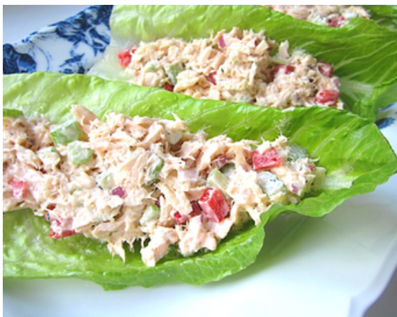
Tuna Lettuce Wraps

Make meals and memories together. It's a lesson kids will use for life.