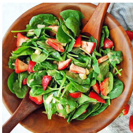
Strawberry Spinach Salad

Make meals and memories together. It's a lesson kids will use for life.