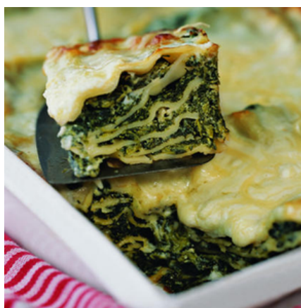
Winter Green Lasagna

For more information about greens and fun activities click here .